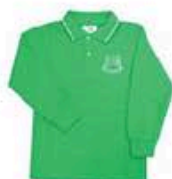
Long Sleeve Polo