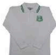
White Long Sleeved Polo