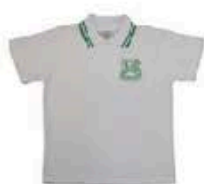
White Short Sleeved Polo