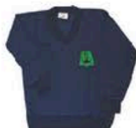
V Neck Jumper