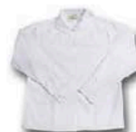
Peter Pan Shirt