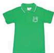
Short Sleeve Polo